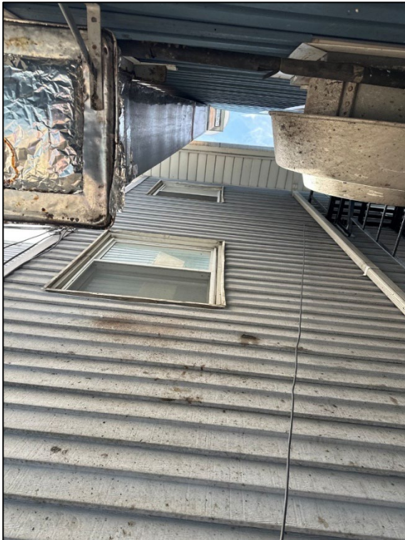
Existing Façade Conditions

We understand that The Housing Authority of the City of Bayonne wants to remove and replace multiple facets of 521 Kennedy Boulevard's façade, including windows, lighting, front door entry, siding, stucco, masonry, soffit, and the garage door.