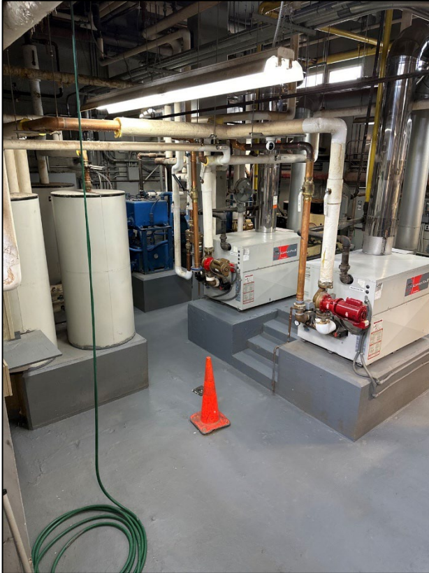
Existing Water Heaters, Storage Tanks & Piping

We understand that The Housing Authority of the City of Bayonne wants to remove and install new water heaters and storage tanks.